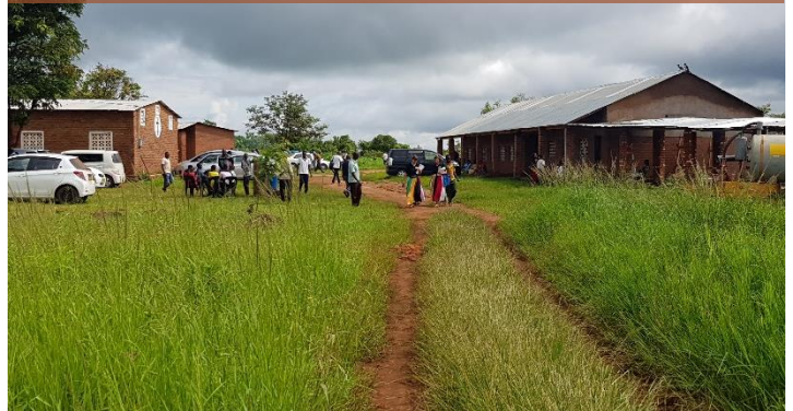
GRACE FARM, MALAWI NAMWERA, MALAWI